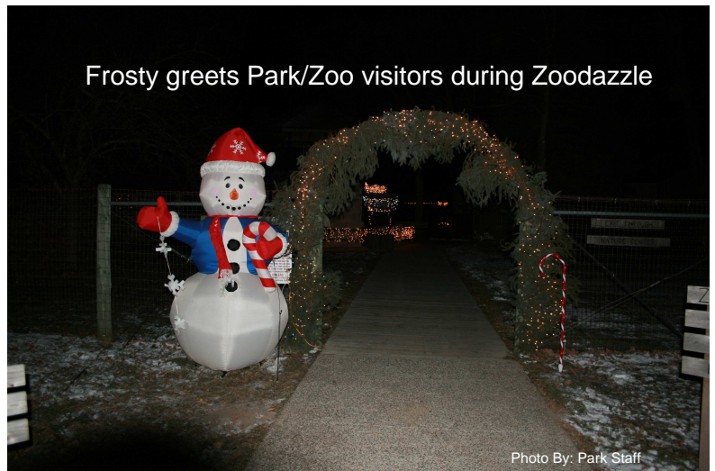
Frosty greets Park/Zoo visitors during Zoodazzle

Things are always changing. Mother Nature showed us how summer changed into fall with frost and leaves slowly falling to the ground. Now we are seeing dark eyed juncos at bird-feeders. Change can be hard for some, but for the most part, it is a good thing.. Months ago you were sent a note that the newsletter will now be published quarterly. This changed from being published bi-monthly was asked of the Board by me. I know how important it is for members to be informed and updated on the comings and goings of the zoo and park. It's going to take several issues before I become comfortable putting the newsletter together.