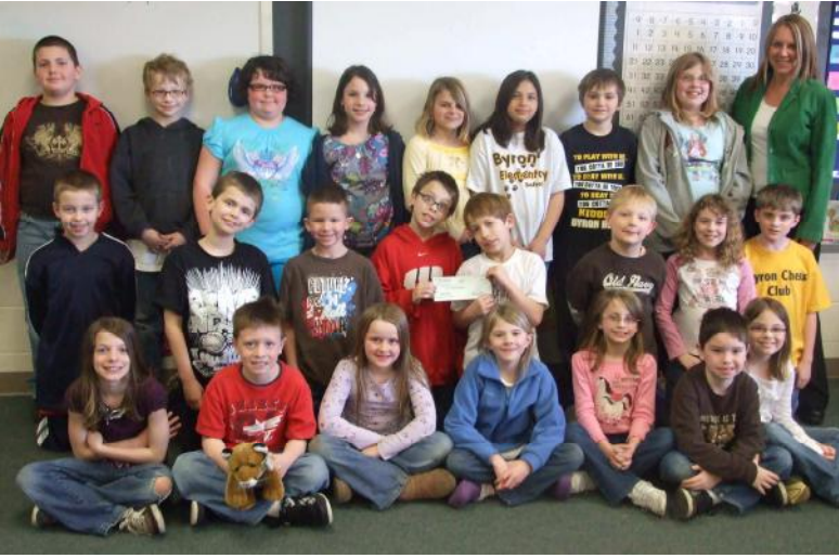
3rd graders hold check for $2683!

Friends of Oxbow has been raising money toward a new Wildcat Exhibit at the Zollman Zoo. The Byron Elementary School classes K to 4th grade chose to help us earn money for our cougar's new home by participating in a Cash for Cougars campaign from March 2 nd to March 13 th . The class that brought in the most money each day got to keep the plush cougar mascot for that day. The first class to win the cougar got to name it - they called it Courage!